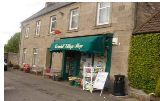
The Village Shop

Employment. The community is small and almost half are retired. Job opportunities are extremely rare in the Parish. Nevertheless there are people who need to find work, and others who have no financial pressure to do so, but would like to work