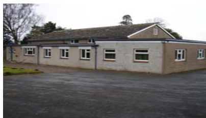
Cornhill Village Hall

asset valued at a little under £300,000 (excluding an area of open land which would realise a very significant amount if developed), the Return on Capital Expended is just 0.2% . These two financial measures strongly suggest the need for more energetic development.