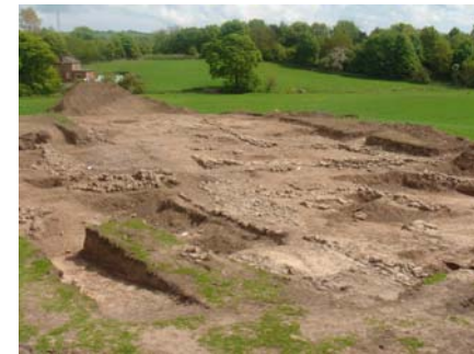
Medieval Manor discovered 2006

More recently evidence of the antiquity of the village of Cornhill was unearthed when bulldozers moved into the field opposite Cornhill Farm. They quickly discovered the site of a medieval dwelling of some size